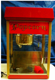
Popper – Table Top