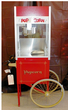
Poppers on Antique Cart